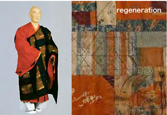
Piece together the old cloth or piece of cloth KESA, YOSEGIRE, SAKIORI